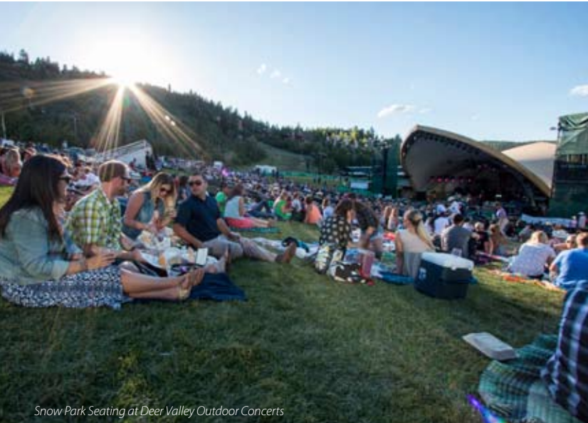
Snow Park Seating at Deer Valley Outdoor Concerts