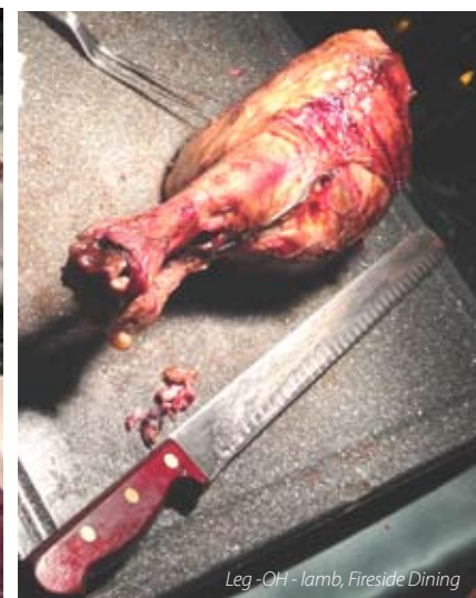
Leg -OH - lamb, Fireside Dining

fixings. Each guest collects this gooey smelly cheese from the first of several huge stone fireplaces where it is melting off half-rounds in front of the flames. The dining experience continues this way, with stews of veal and wild mushroom at the next fireplace, and so on. Roasted lamb legs are literally hanging and spinning at the third fireplace. Dessert fondues of chocolate, caramel and white chocolate Grand Marnier bubble-like molten lava for a grand finale at the last fireplace. It’s a one-of-a-kind dining experience worthy of a fireside selfie, but don’t, you might break the spell.