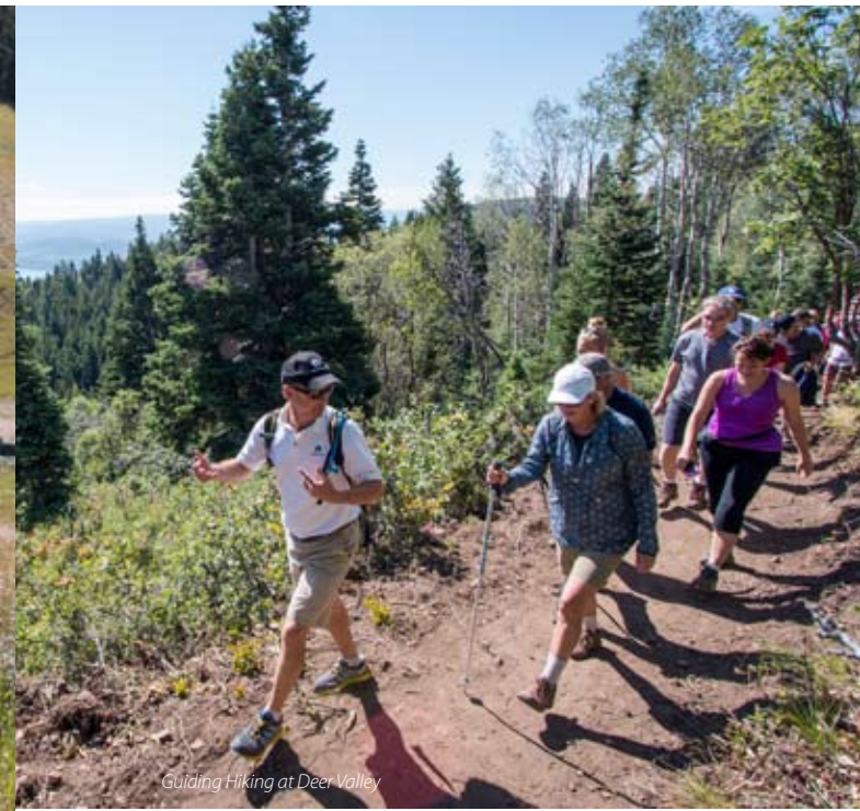
Guiding Hiking at Deer Valley

When it comes to mountain biking in the summer, Deer Valley yet again makes it really easy! From bike rentals at the base, to lift-served single track trails, to wider, easier, “flow” trails, they’ve made the sport less hassle and more fun.