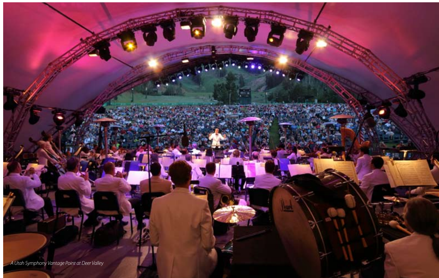
A Utah Symphony Vantage Point at Deer Valley