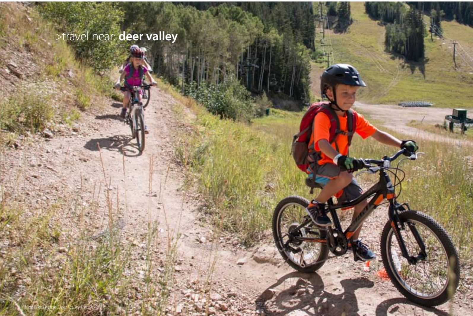
Kids Bike Lesson Deer Valley Resort