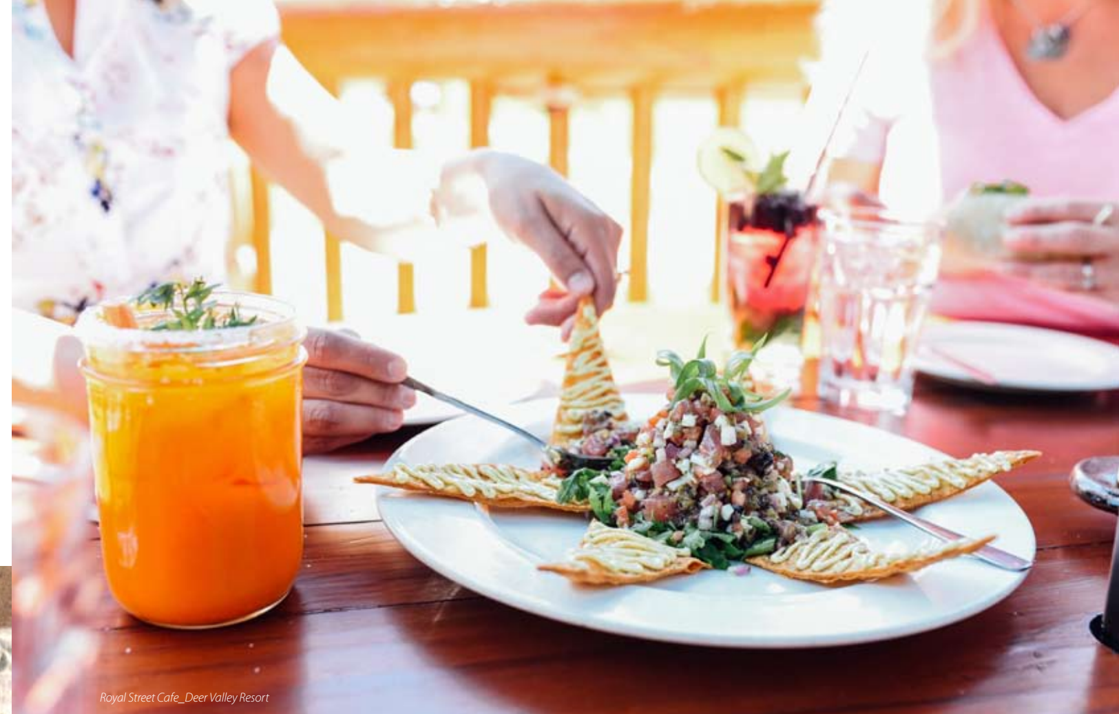
Royal Street Cafe_Deer Valley Resort

Put Deer Valley Fireside dining on your wintertime bucket list. It’s a phenomenally romantic dining experience attributed to the Alpine shepherders of the Middle Ages. It begins with a first course of Swiss raclette cheese, accompanied by a buffet of