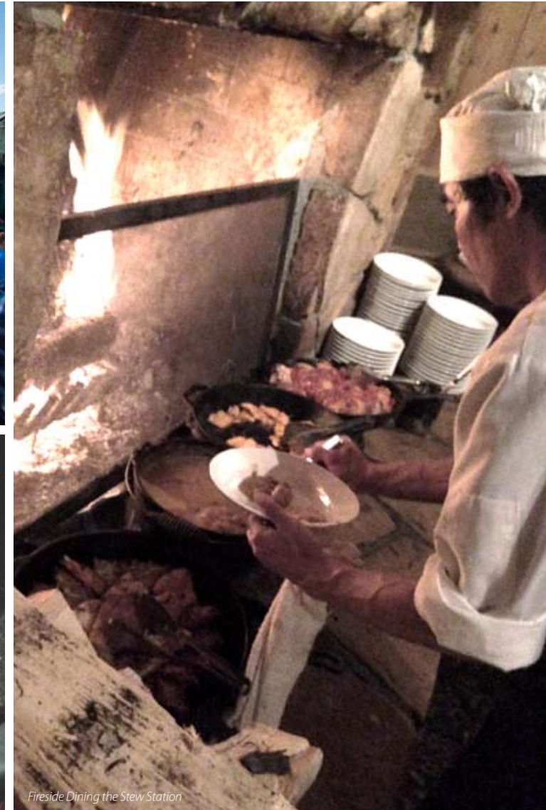
Fireside Dining the Stew Station