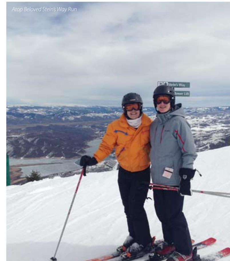
Atop Beloved Stein's Way Run

Deer Valley has a place to check your skis right at the base of the mountain, about 20 paces from where you put them on – and it’s complimentary! This is such a no-brainer, I can’t image why more resorts don’t do it. Any skier knows that the schlepping involved in the sport can curb your fun. Here, you carry your skis (or a valet will do it!) from the car to the mountain, or the rental area to the mountain, just once for the duration of your ski trip. Halleujah.